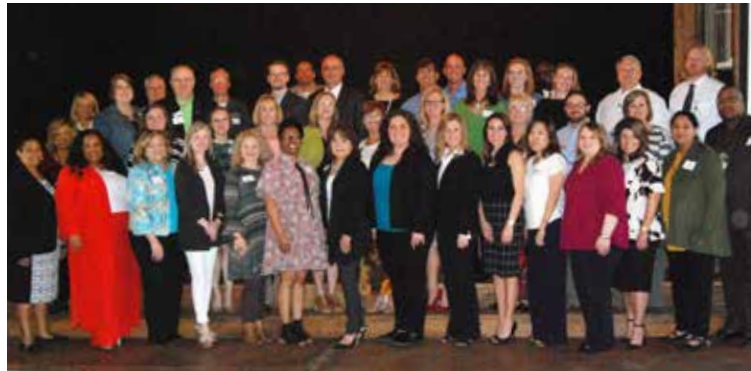
Leadership Dothan Alumni.