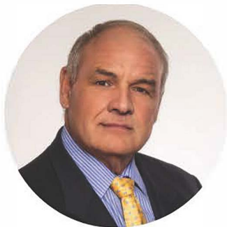
CHARLES E. OWENS Construction Partners Inc.