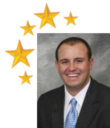
Hunter Green Todd and Sons