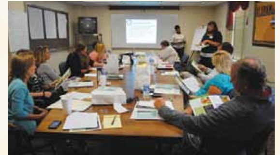
The Dave Mathews Center for Civic Life, Dothan Area Chamber of Commerce Education Committee, Evergreen Presbyterian Church's Center for Dialogue and Discernment will offer a Moderator Development Workshop.