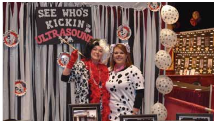
Third Place Winner See Who's Kickin, LLC