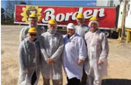
The Grow Dothan team recently met with officials from Borden Dairy of Alabama to discuss business opportunities, workforce development and community involvement. During the visit, the team had the opportunity to tour the Dothan facility.