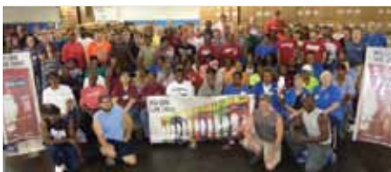
Swedish Match Cigars' Dothan employees celebrate achieving another "Outstanding Safety Milestone" by working three years, or 826,759 hours, without a lost time accident.

Congratulations to the Dothan employees on achieving this milestone!