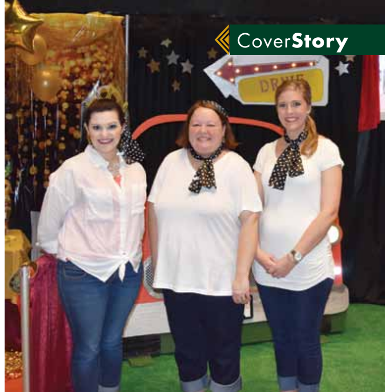
First Place Winner SpectraCare Health Systems Inc.

▶ See page 6 for a list of the 2016 Spotlight on Business participants and event pictures.