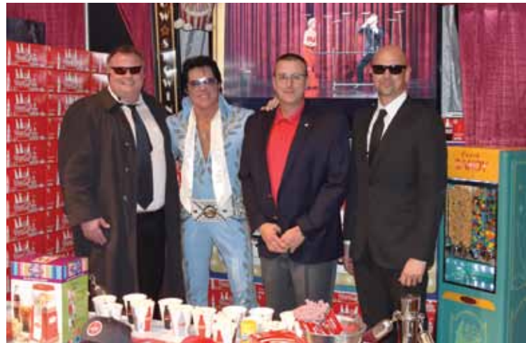
Second Place and People's Choice Award Winner Coca-Cola Bottling Co. United Inc.