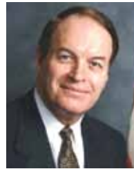
Sen. Richard Shelby

Wiregrass Rehabilitation Center Inc.'s Sterling Event Services Rotary Hall Jan. 8, 2016 • 8 a.m.