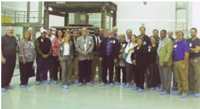
Individuals attending the SpaceTEC Annual Review of Operations were treated to a tour of ASTROTEC, a space vehicle launch preparation facility, which was quite impressive.

New skills required by technicians in the next three years include: additive manufacturing, mechatronics and new materials with embedded sensors.