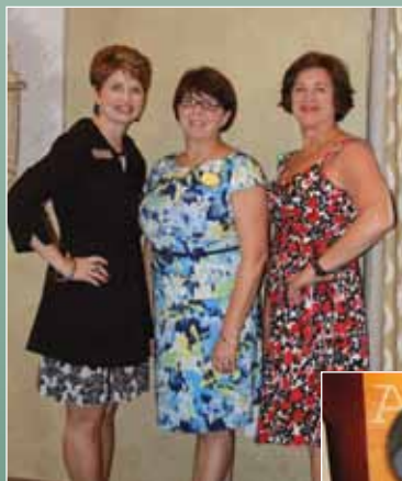
The Network Exchange June 2015