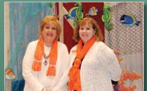
Spotlight on Business 2015