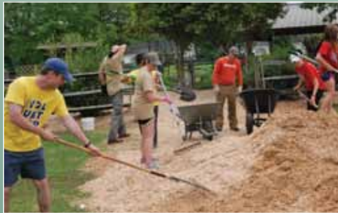
Spirit of Service 2015