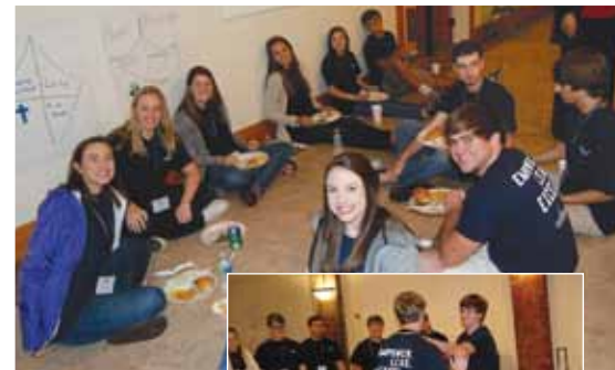
Youth Leadership Dothan-Houston County Class XXIV Opening Retreat.