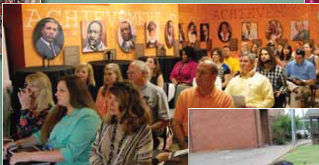
Networking 101 Seminar March 2015