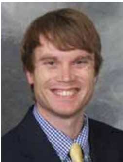
Joseph Brackins Army Aviation Center Federal Credit Union