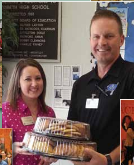
Teachers Appreciation Day