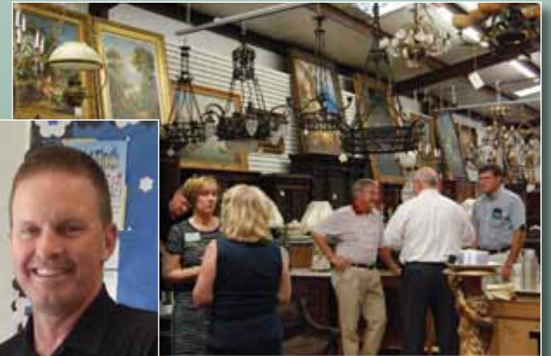
Network Exchange September 2015