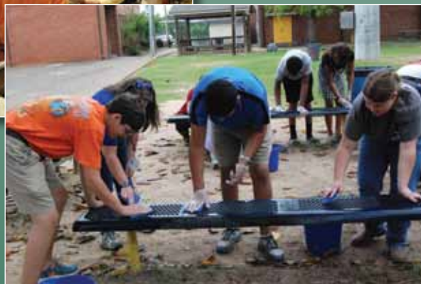
Spirit of Service 2015