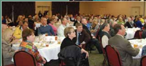
General Membership Luncheon January 2015