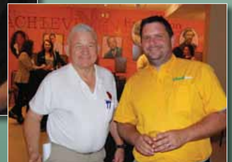
The Network Exchange March 2015