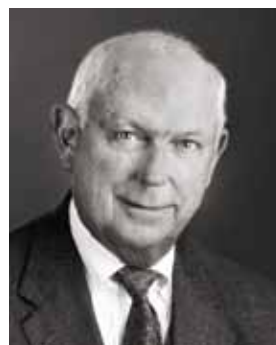
John H. Edge Flowers Hospital