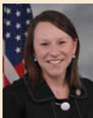
Rep. Martha Roby

Rep. Martha Roby will be the guest speaker at the Dothan Area Chamber of Commerce's General Membership Luncheon scheduled for Tuesday, Aug. 25, at noon at Wiregrass Church. Buffet will open at 11:30 a.m.