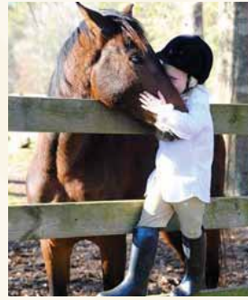
Ninth Annual Heritage Farm Day and Trail Ride will take place Saturday, April, 12, at The Maddox Farm.

For more information or to register for the Trail Ride or WoodStrong Farm Challenge, visit www.themaddoxfarm.com or call (334) 677-7856.