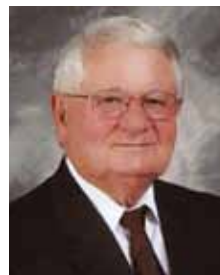
Dr. Jack L. Sasser Wiregrass Rehabilitation Center Inc.